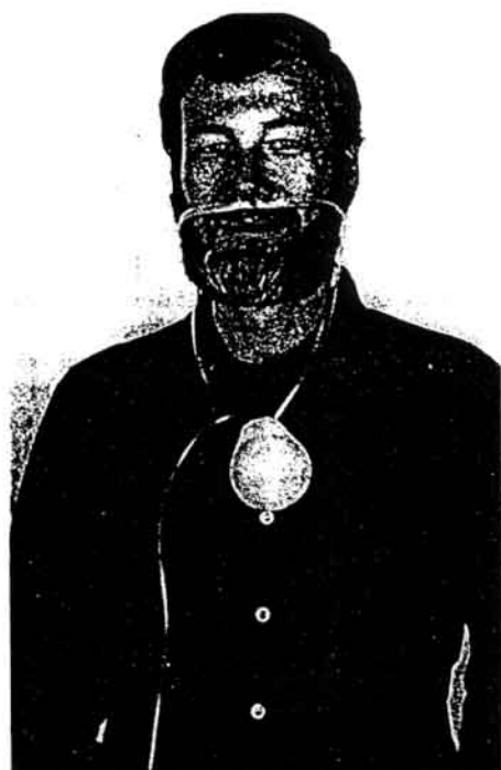
FIGURE 1. The pendant oxygen conserving nasal cannula showing the nasal prongs, storage/reflux conduit, and reservoir.

and oxygen flow was metered via a spirometrically calibrated Gilmont rotometer accurate to \pm 0.05 L/min. The study was performed with the subjects in a comfortable upright seated position. We measured oxygen saturations at room air, 0.5, 1.0, 2.0, 3.0 and 4.0 L/min using the standard steady flow nasal cannula and at 0.5, 1.0 and 2 L/min using the pendant conserver cannula. The order of presentation of cannulas was randomized, but all measurements started with lowest flow progressing to the highest flow. They were allowed to return to baseline by breathing room air between cannula changes. We determined the time required for saturation equilibration to occur and added two minutes to each oxygen flow level prior to recording saturation in an effort to assure that equilibration had taken place. We compared the mean saturations for each cannula at .5, 1, and 2 L/min using an analysis of variance.